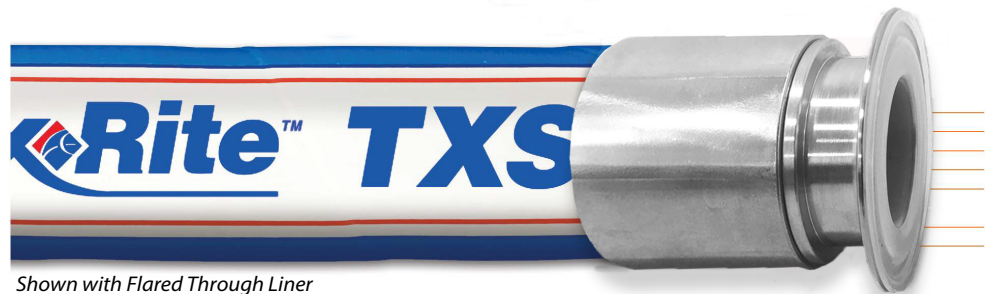
Shown with Flared Through Liner

TXS/TXS-C has a PTFE liner, manufactured from PTFE material in accordance with FDA requirement 21 CFR 177.1550 and is also manufactured solely from materials which meet the requirements of the 3-A Sanitary Standards. Although the tubes interior surface meets the 3-A definition of (substantially flush) a micro ripple occurs during the compression molding process.